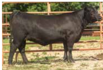
DHT MAG QUEEN LATIVA 352 PGD OF LOT 11