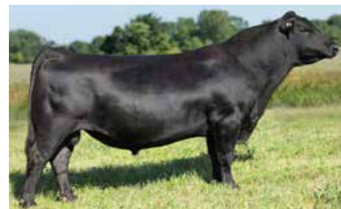
HPCA VERACIOUS SERVICE SIRE OF LOT 67