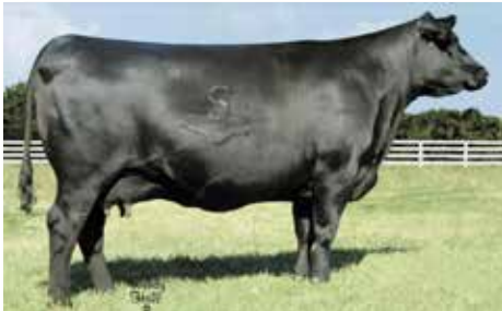
ROTH PRIMROSE 1247 MGGD OF LOT 32