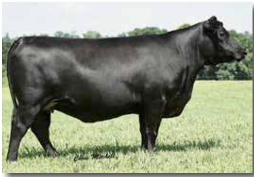
WILLIAMS PROP ERICA 255 110 MGD OF LOT 65

Consigner: Byrne Angus Ranch Randy Byrne 817-517-1587