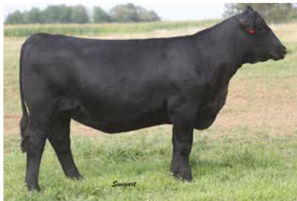
MBF CAPSTONE FIREBALL I41 DONOR DAM LOT 62

Selling Choice of Lot 62 or 62A 3 IVF Embryos and Guaranteeing 1 Pregnancies if transferred by an AETA certified embryologist or Whitaker Embryo services. Buyer will be furnished with certificate of embryo transfer.