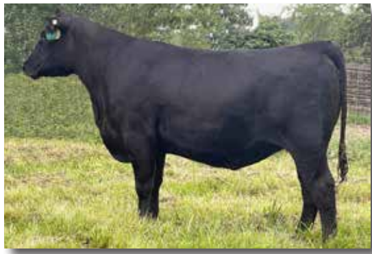
VA PLEASANT PRIDE J507 LOT 41