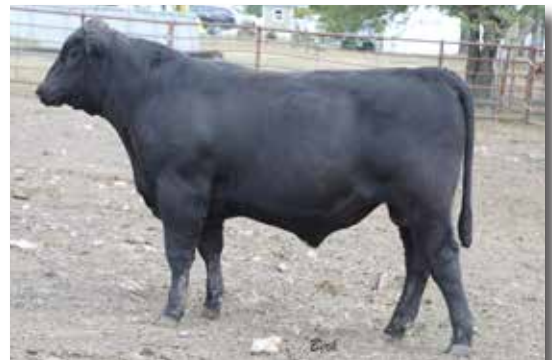
BMA GAVEL 243 LOT 15

Consigner: Blue Mound Angus Sheldon Swartzentruber 417-327-5885 Sired By SydGen KCF Gavel the $240,000 valuation sire at SydGen. Top 10% $C, Top 10% $B. His Dam is a good producer of Herd Bulls, Blue Mound Considers her one of the Good Ones! Blue Mound Sold a Gavel son in the Power Sale October of 2022 for $5200 that topped the bull division!