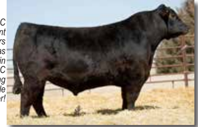
POSS DEADWOOD SERVICE SIRE OF LOT 38

Of the Top 50 $C non-parent Deadwood Daughters in the Breed there has been an increase in Dam's $C to Calf's $C of 58 points, making Deadwood an incredible $Value Booster!