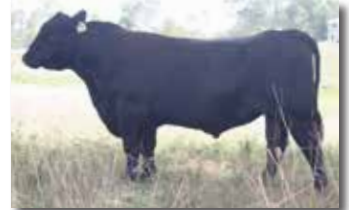
SYDGEN RESOLVE 7132 SERVICE SIRE FOR LOT 43, 44, 8 45