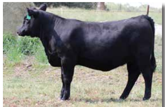
AF FOREVER LADY 3822 LOT 34A

3822 is a deep bodied, square hipped Guarantee daughter. She is clean fronted, and has an excellent set of feet on her. She is a double threat as she looks amazing and hits all the numbers! Note her double digit calving ease +11, that grows into TOP 10% YW. She is feed efficient, and fertile, with RADG & HP both TOP 15%. Be sure to check out her $Values as well +308 $C and TOP 2% $M & $W. This female has foundational written all over her, use her to breed your next sale attraction for the Power Sale!