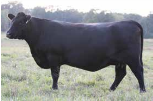
WRR FOREVER LASSIE 996 LOT 24

Consigner: Wiles Ridge Ranch Truman Wiles 417-252-0726 Powerhouse Jet Black daughter. You will be impressed with her length of body and overall thickness. She is one of only 7 dams in the breed with her combination of CED, WW, YW, RADG, CW and MARB. She has calving ease, tremendous growth, feed efficiency, and carcass traits. She is a maternal sister to the record high selling bull at the tested bull sale at $12,500. Her cow family has shown amazing productivity. Her dam has 10 natural calves with a 393 day calving interval. In addition, she has 7 embryo calves, and she is doing well at twelve years of age. Her granddam had 13 natural calves with a 381 day calving interval. In addition, she has 9 embryo calves, and produced well to 16 years of age. The projected EPD's of her Fireball calf: CED 12 WW 77 YW 144 CW 78 MARB 1.59 $C 345. Her calf will be genomic tested prior to sale date. This is a chance to add a herd builder with years of productivity in her. Bred 12/08/2022 to GB FIREBALL 672 Reg # 18690054 UPDATE BULL CALF BORN 9/19/23 - HERD SIRE ALERT!