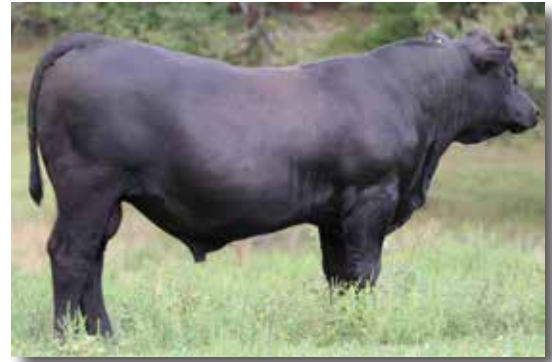
WRR PEYTON 256 LOT 13

Consigner: Wiles Ridge Ranch Truman Wiles 417-252-0726 Heavy muscled, well balanced PEYTON/ GROWTH FUND combination. He is a Show-Me Select qualified bull. He has curve bender numbers. Top 10% calving ease with Top 4% weaning weight, and Top 10% yearling weight. He has a top 25% scrotal EPD. This bull has a really nice set of feet and legs and looks really good when he walks out.