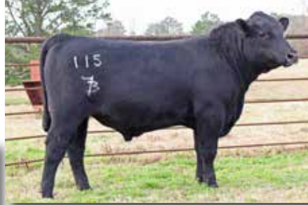
GB FIRESIDE 115 SERVICE SIRE OF LOT 60

Selling 3 IVF Embryos and Guaranteeing 1 Pregnancies if transferred by an AETA certified embryologist or Whitaker Embryo services. Buyer will be furnished with certificate of embryo transfer.