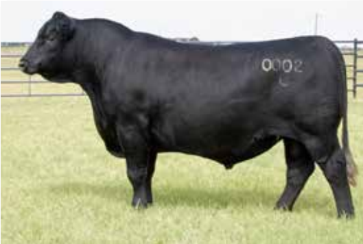
EAR PRIME TIME 0002 SERVICE SIRE LOT 61

Selling 3 IVF Embryos and Guaranteeing 1 Pregnancies if transferred by an AETA certified embryologist or Whitaker Embryo services. Buyer will be furnished with certificate of embryo transfer.