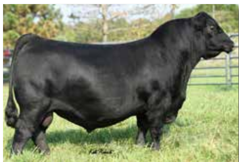
CONNELLY COMMERCE SERVICE SIRE OF LOT 41 & 42