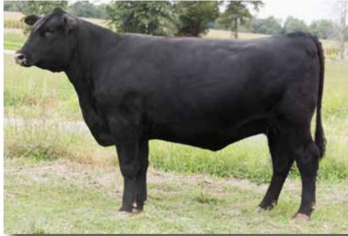
SEAGRAVES RUBY 2180 DONOR DAM OF 20A & 20B

The Ruby Family is one of the great maternal families of the breed. The MGGD Ruby 2372 was selected as the top-selling bred heifer of the 2014 44 Farms Spring Sale and is an outstanding carcass leader in the 44 Farms donor program. The MGD 6218 has been an excellent donor for Seagraves, a maternal sister to this heifer is the Ruby 6218 who is a donor at 44 Farms. 2180 combines the attractive big-hipped, wide base of Home Town with the femininity and maternal traits of the Ruby line. 2180 is an exquisite blend of phenotype and genotype; double digit calving ease, massive growth, feed efficiency, fertility, marbling, and a $C of +348. She truly does it all!