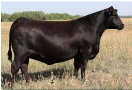
GVC SUSANNA J028 DONOR DAM OF LOT 68

Consigner: Soaring Eagle of the Ozarks Dr. Jeff Gower 417-839-1200 GVC Susanna J028 is the $240,000 valuation female, and proven donor of Soaring Eagle. An elite female with a stellar EPD profile. Her double digit calving ease and high growth EPD spread is elite along with all the other data, at the same time this is a very attractively made female. ELEVATE ranks at the top of the breed for WW, YW, HP, CEM, MILK, MARB and REA, all with a +8 Show-Me-Select Calving Ease. Few sires offer the complete genetic package as ELEVATE. Interim this mating offers Show-Me-Select Calving Ease, Top 1% WW & YW, and TOP 1% $C!