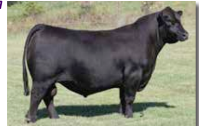
STEVENSON TURNING POINT SERVICE SIRE FOR LOT 39