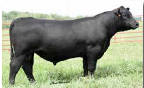
E W A ELEVATE 1166 SERVICE SIRE LOT 64