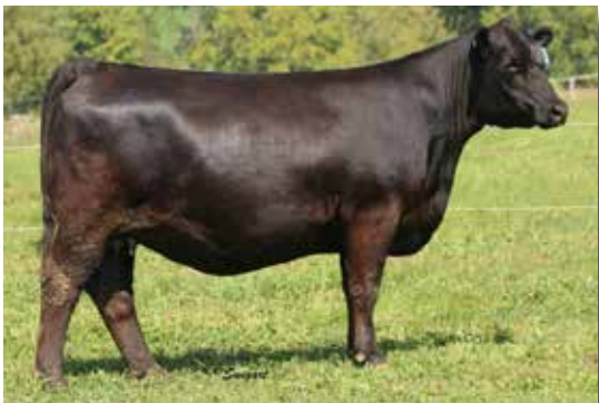
OKDALE RITA 821 0204 DONOR DAM OF LOT 69

Consigner: Ozark Mountain Angus LLC Michael Ingram 417-489-0849 Oakdale Rita 821 0204 is the $55,000 valuation donor female. She boasts a Show-Me-Select Calving ease that combines with TOP 1% WW & YW, as well as TOP 2% RADG feed efficiency. A true spread female with excellent carcass traits and $Values. The dam of 821 0204 is a direct daughter of the $100,000 record-selling Edgewood Angus donor and now-deceased De-Su Farms cornerstone, 3128 sired. Breakthrough has demonstrated his prepotency for DNA and already sired many of the highest $C cattle on the sorts.