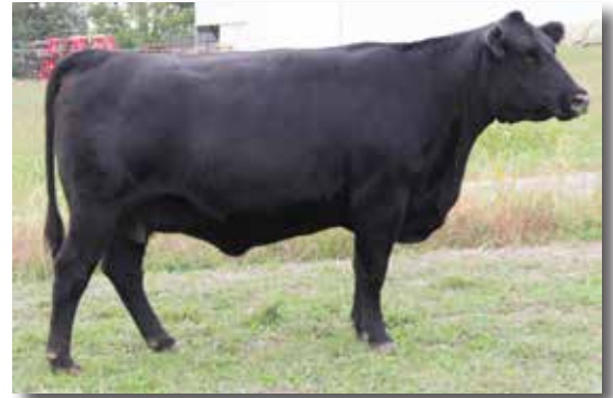
SEAGRAVES WOKER LUCY 2042 LOT 33

Lucy 2042 has an excellent pedigree she combines the esteemed Lucy line, which stems from the Basin Lucy 178E and one of the hottest bulls in the Breed Fireball. Lucy 66054 is a direct daughter of the second-generation 44 Farms and Hopper Angus donor, Lucy 4313. Be sure to study the calving ease, heifer pregnancy, marbling, ribeye, and $Values on this female as her combination is extremely special! There are so many possibilities with the female as both her CED +17 and $C +353 are TOP 1%. She is due to calve 12/23/23 H P C A Vision (Reg #20226737) CED +12, WW +85, YW +162, RADG +0.38, Marb +1.52, $B +236, $C +372. This mating will have multitudes of genetic potential.