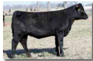
POWELL KARAMA 7067 PGD OF 9