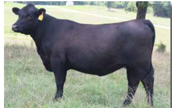
RAF LADY ERICA 2207 LOT 45

Consigner: Redwine Angus Farm Jake Redwine 870-810-3901 An absolutely gorgeous exponential daughter, that goes back to the great 908 donor and Ten X. She combines the femininity and clean front of Ten X and 908 with spring of rib and depth of body. This female really stands out! Note her double digit calving ease, TOP 3% SC, and TOP 10% Marb. Loads of potential in this female and future mating as she carries a TOP 1% SC and TOP 2% Marb Genomic. Be sure to check her out sale day. Pasture exposed to SydGen Resolve 7132 (Reg #18769311) CED +13, MARB +1.02, $C +299. Pasture exposure dates 7/10/23-10/13/23.