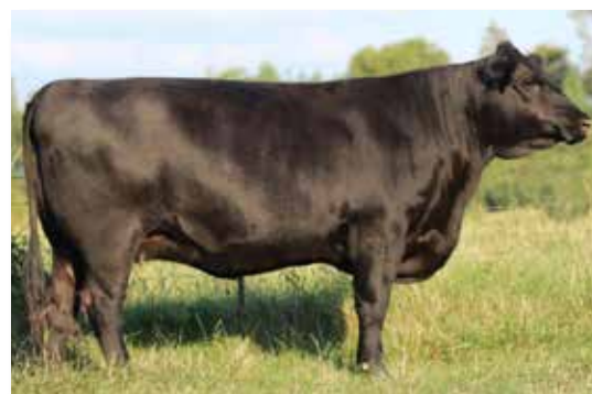
MISS BLACKCAP LOT 56

Consigner: Simon's Tall Pines Drew Simon 417-838-2521 Miss Blackcap is from a long line of very productive cows. She was bred to WRR Theford 203 (Reg # 20370961 CED +11, WW +82, YW +148, Milk +34, $B +207, $C +340) on 5/8/23 and is due to calve on 2/15/24. Miss Blackcap boasts EPDS of WW +78, YW +137, and TOP 3% $W +77. She is a well built cow with lots of depth of body and width. She has excellent maternal qualities with her TOP 10% CEM, +31 Milk, good udder, and wonderful disposition! Miss Blackcap will make an fantastic addition to your herd!