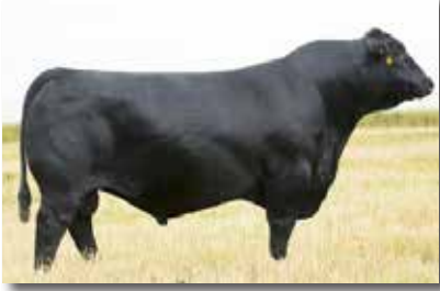
JINDRA MEGAHIT J 233 1626 PGS OF LOT 9