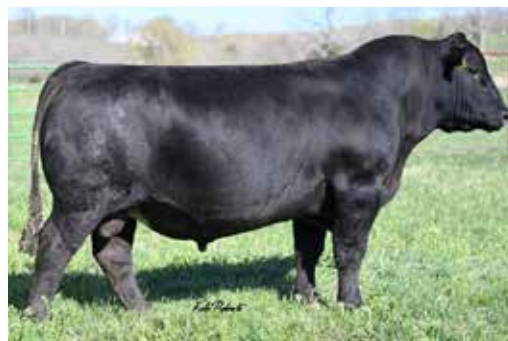
WILLIAMS JONESBORO 700-602 LOT 75 SEMEN

Consigner: Byrne Angus Ranch Randy Byrne 817-517-1587