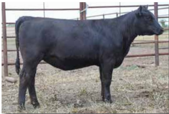
BMA QUEEN 250 LOT 53