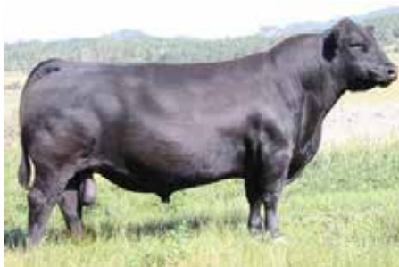
S S ENFORCER E812 PGS OF LOT 11

Consigner: DHT Angus Cecil Huff 417-250-1300 Calving is easy in top 10% of Angus breed. Top 20% DMI makes him an easy keeper. Top 2% CEM and top 3% Milk and top 5% DOC. Top 15% of breed for $W. Here is a cow maker suitable for Calving ease and a heifer breeding program. Take note of his actual weaning weight! 17 EPD in top 50% or higher.