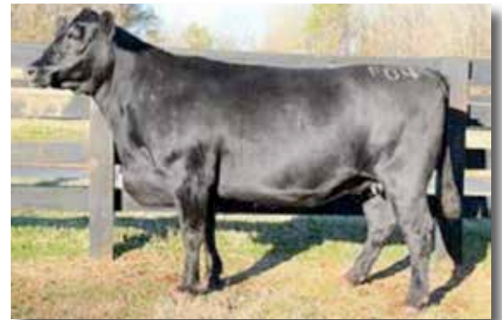
F A R RITA 9Q13 OF 2729 F04 MGD OF LOT 2