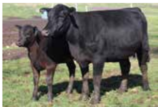
BMA RUBY ROSE 928 BMA RUBY ROSE 158

BMA Gavel 248 is a maternal brother of BMA Ruby Rose 928, who produced the De-Su Volunteer daughter BMA Ruby Rose 158. The Top Selling Pair for $25,000 at the Spring 22 Power Sale.