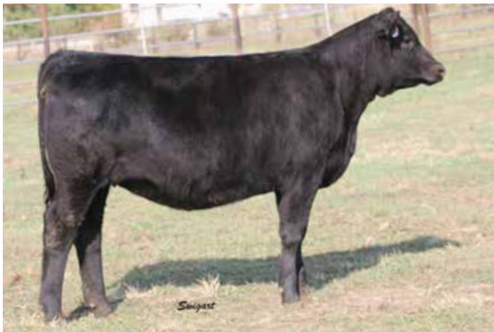
BH PARAGON 2021 DONOR DAM OF 21

Genetic outlier for $M and $C combination, ELEVATE offers an elite EPD profile that is hard to match. He ranks at the top of the breed for WW, YW, HP, CEM, MILK, MARB and REA, all with a +8 Show-Me-Select Calving Ease. Few sires offer the complete genetic package as ELEVATE.