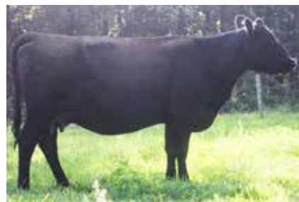
BUBS JILLIAN 82F LOT 27