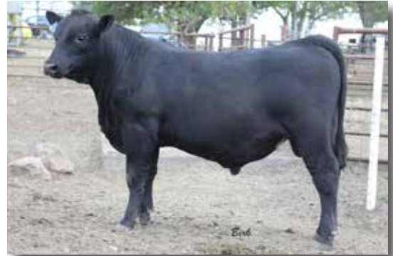
BMA VOLUNTEER 242 LOT 14

Consigner: Blue Mound Angus Fred Swartzentruber 417-327-3752 Sired by DE-SU Volunteer B122. Volunteer is now deceased with limited semen available. Top 1% $C, Top 1$ B, Top 2% Mart, Top 1% CW, Top 2% $W. The Top $C bull of his calf crop at Blue Mound Angus. Ratio of 117 at weaning and Ratio of 111 at Yearling. Be sure to check him out sale day, as he has the highest $C of any bull that was raised at Blue Mound Angus!