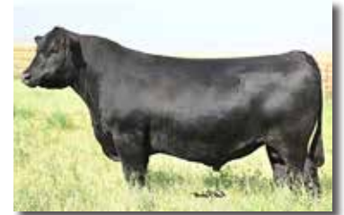
H P C A VISION SERVICE SIRE OF LOT 33