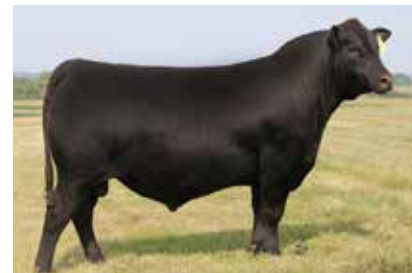
ANKONIAN PARAGON 0C4 SERVICE SIRE LOT 62A & 63