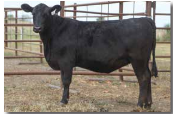
BMA ERICA 236 LOT 50

Consigner: Blue Mound Angus Fred Swarzentruher 417-327-3752 Sired by SydGen KCF Gavel the $240,000 valuation sire at SydGen. Top 2% $C, Top 4% $B, Top 2% $W, Top 3% CW. The Erica's are a prolific line at Blue Mound Angus, with many females in the herd! This female had a ratio of 112 at weaning and 113 at yearling.