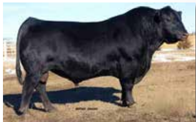
PA POWER TOOL 9108 MGS OF LOT 26