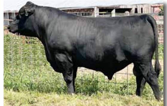
VA EMERALD J520 LOT 3

Consigner: Voss Angus David Voss 314-420-0241 J520 is out of a hard working 10 year old dam acquired from the Circle A dispersal. The sire of this bull is Connealy Emerald, long known for siring front pasture type cows that thrive on Missouri type pastures. If you need a bull to sire those females that bring in big calves and don't bust the bank while doing it, Va Emerald J520 needs to go home with you. Best suited for cows.