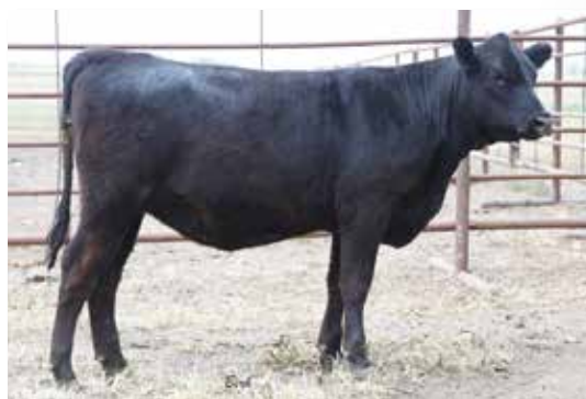
BMA IDESSA 235 LOT 49