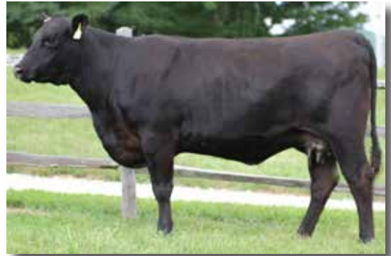
A A ROYAL LASS 41 LOT 23