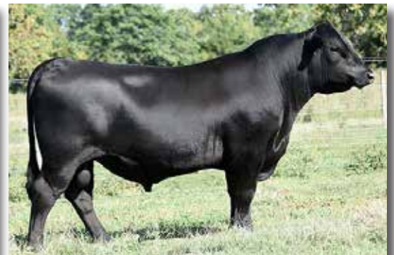
E W A CAPTAIN SIRE OF LOT 20B

Ring Side Phone Bidding Available Brett Sayre 573-881-1876 Scotty Crawford 816-804-1410 -OR- Online Bidding Available www.LiveWireAuction.com