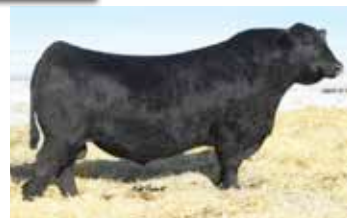
V A R CONCLUSION 0234 SERVICE SIRE OF LOT 70