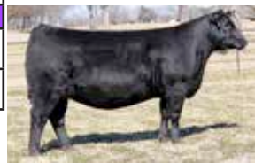
44 RITA 6291 MGD OF LOT 70