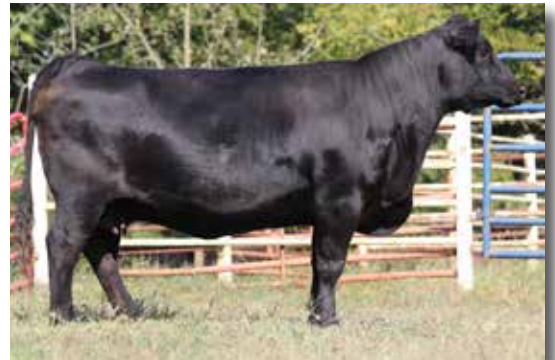
CMF 22X FOREVER LADY 262C LOT 34

A really nice cow, with proven success! 262C is an amazing genetic transmitter and has created many foundational curve bending number animals for Asher Farms. Her Monumental daughter sold in the Spring 2023 Power Sale for $6100. Her Guarantee daughter lot 34A is a +308 $C! Note her double digit calving ease, Top 15% Scrotal, and TOP 15% $W. She is AI bred to Crawford Guarantee 9137 (Reg # 19526770) and due 11/30/23. Be sure to check out Lot 34A to see the potential in this mating! Here is an excellent chance to get the factory, daughter, and full sib!