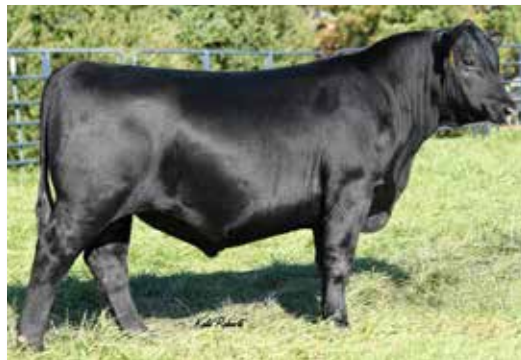
BEAL BREAKTHROUGH SIRE OF LOT 20A

Offering choice of 20A or 20B guaranteed heifer pregnancy due 12/09/23 to either Breakthrough or Captain.