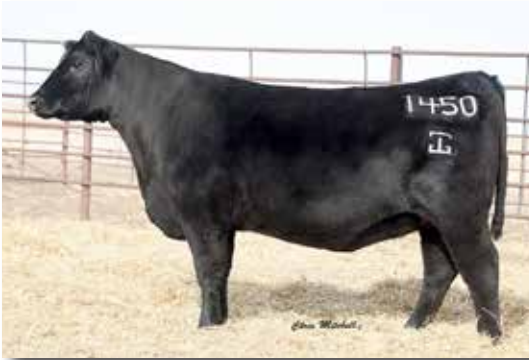
G A R HOME TOWN 1450 DONOR DAM LOT 61

G A R Home Town G A R Home Town 1450 (Reg # 19862610) G A R Sure Fire 1087