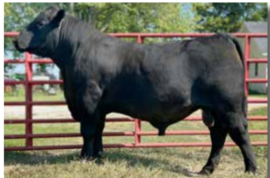
E-LEE HUCKLEBERRY ANDY LOT 7