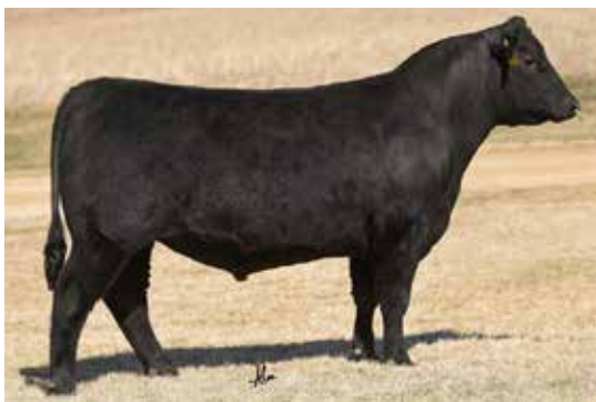
E W A ELEVATE 1166 SIRE OF LOT 21