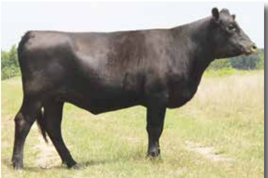
RAF PRITTA OF CONANGA 2201 LOT 43