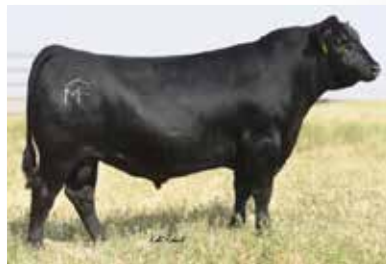
MEAD MAGNITUDE PGS OF LOT 37

Consigner: DHT Angus Cecil Huff 417-250-1300 This female qualifies as Seed Stock certified. This double digit CED and CEM heifer has top 15% WW at +75 and YW EPD of +136. A very well balanced heifer with 23 EPD's in top 30% or higher. Take note of top 5% SC and top 25% or higher Claw and Angle Pasture exposed to Rainfall son. Rainfall was the 3rd most used AI bull in Angus breed with 4698 progeny. AI To Fireball 02/03/2023 Reg 18690054 Pasture exposed to 20421399 Rainfall progeny from 02/05/2023 to 06/06/2023