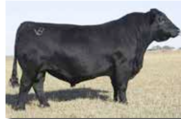
JMB TRACTION 292 PGS OF LOT 39