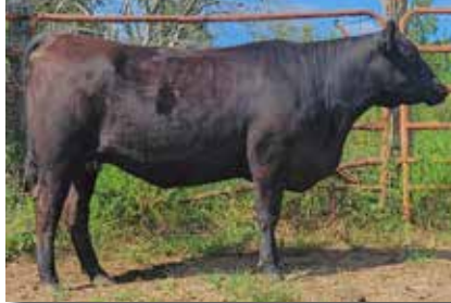
DHT CHARMER 407 PRIDE A71 LOT 36