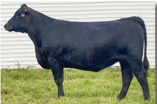
VA FANNY J511 LOT 42