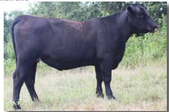
RAF LADY PRINCESS 2203 LOT 44

Consigner: Redwine Angus Farm Jake Redwine 870-810-3901 A really nice heifer sired by Greater Good. Check out the profile on this heifer with a big square hip, frame, and femininity in her front. Excellent growth WW TOP 1%, YW TOP 2%, and feed efficiency RADG TOP 10%. This heifer is sure to pack the pounds on her calves! Be sure to check out the genomics on 2203 as she is TOP 1% WW, TOP 2% YW, and TOP 1% CW. Pasture exposed to SydGen Resolve 7132 (Reg #18769311) CED +13, MARB +1.02, $C +299. Pasture exposure dates 7/10/23-10/13/23.