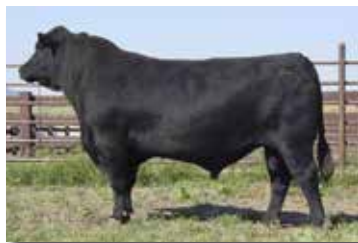
AA R TEN X 7008 S A PGS OF LOT 26

Consigner: Hudson Angus Farm Roland Hudson 573-338-2040 A female in her prime that is deep bodied with excellent spring of rib. She produces front pasture progeny. In full disclosure cow had teat that was cut, it healed and she has raised two amazing calves. All male calves have sold as bulls, always sold in top 1/3 of sale. Cow's quality of offspring has kept her in herd. AI to Exponential on 11/20/22 then pasture exposed to AAA 20281278. Gentle cow with only daughter retained.