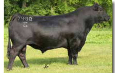
GAR HOME TOWN SIRE OF LOT 1 & 2