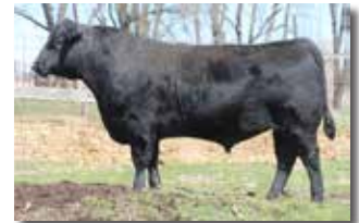
WRR TRUEBLOOD 468 MGS OF LOT 22