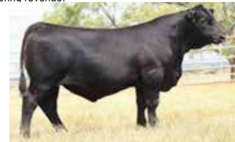
PAR ARES 0615 SERVICE SIRE OF LOT 66

Par Ares 0615 has excellent numbers and stems from a long line of fantastic females. The dam of Ares is one of the lead donors at Percy Angus Ranch, and she has now produced more than $750,000 in offspring revenue.