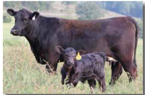
WRR FOREVER LASSIE 155 LOT 22