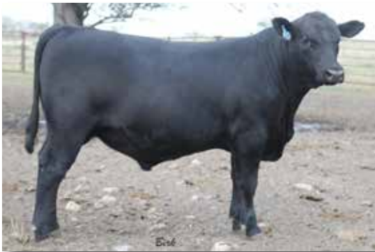
BMA GAVEL 248 LOT 16

Consigner: Blue Mound Angus Fred Swartzentruber 417-327-3752 Sired By SydGen KCF Gavel the $240,000 valuation sire at SydGen. The Dam of this Bull is also the Dam of the Great BMA Ruby Rose 928 which sold as a pair in the Spring 2022 Power Sale for $25,000!