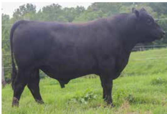
BRANDED COLOSSAL 551 LOT 6

Consigner: Branded Cattle Co. Bobbie & Chad Hindman 417-234-5511 A really top bull with an excellent blend of Enhance Calving Ease and Colossal's powerful muscle and wide base. Note his Show-Me-Select Calving Ease +8 and actual birth weight of only 62 pounds. Top 25% CEM and +29 Milk which will make excellent daughters for retention. Also Top 30% $W. A solid bull with a very nice muscle pattern and phenotype.