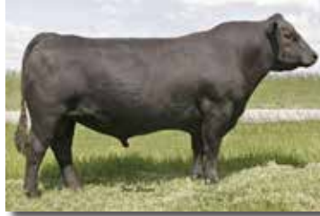
K C F SOUTHSIDE 759 PGS OF LOT 35