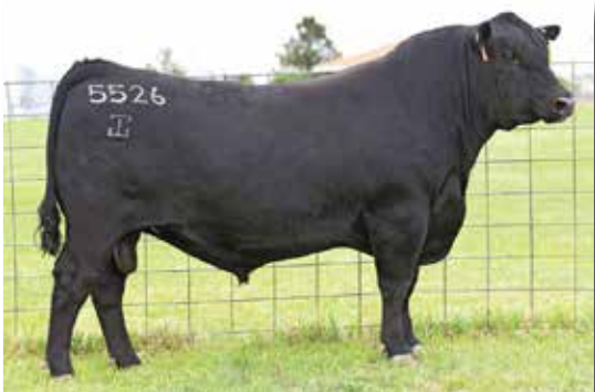
G A R QUANTUM SIRE OF LOT 25

Consigner: Hudson Angus Farm Roland Hudson 573-338-2040 The cow was purchased as a calf from Ray Apple in Kentucky. Gentle cow. Has 2% WW, 3% YW, 15%SC, 20% DOC, 3%CW, 1%RE, and 10%$C. Has been an excellent female. AI to Man in Black on 1/27/23 then pasture exposed to AAA 20281278.