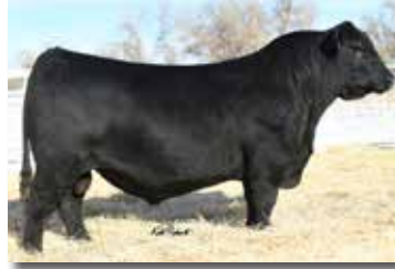
ELLINGSON DEEP RIVER SERVICE SIRE OF LOT 30

Consigner: Hudson Angus Farm Roland Hudson 573-338-2040 Cow's bull calves have always made it to the keep pen. Cowman's kind of progeny. 1615's 2020 daughter's bull calf sold at weaning for $5,000. 1615's progeny's offspring are her greatest legacy in my herd. AI to Man in Black on 12/20/22 then pasture exposed to AAA 20281278. Two daughters are retained.