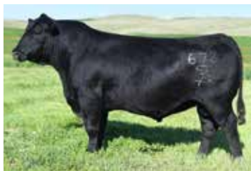
GB FIREBALL 672 SIRE OF LOT 24A