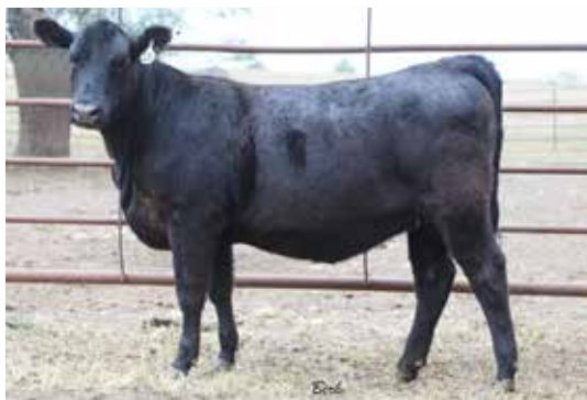
BMA RITA 226 LOT 48

Consigner: Blue Mound Angus Fred Swartzentruber 417-327-3752 Sired by DE-SU Volunteer B122. This female is one that Fred wanted to keep and only added to the Power Sale as a sale FEATURE! The TOP $C female of her calf crop at Blue Mound Angus. Top 1% $C & $B, Top 2% Mart. Her dam has a nice udder. This heifer at a ratio of 107 at weaning and 101 at yearling. Note, this female is a maternal sister to the dam of the BMA Volunteer 242 bull also in this sale.