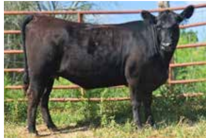
DHT MAG GRANITE 660 EASE A77 LOT 37