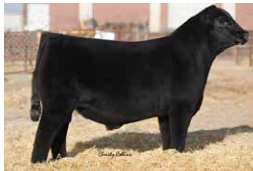
SILVEIRAS STYLE 9303 LOT 74 SEMEN