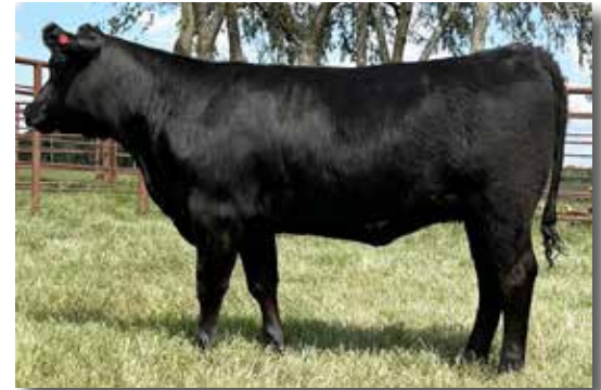
SMPAR RITA 210-110 LOT 52

Consigner: Show Me Prime Angus Ranch LLC Danise Cummings 417-388-8461 Really nice, well-made heifer. She has outstanding EPD's across the board, with Top 10% $W, Top 20% $M and $C, Top 20% $G and $B. Note how balanced this heifer is she has 20 EPDs that are TOP 25% or better, and every dollar value is TOP 25% or better! Sells Open ready to breed to bull of buyers choice.