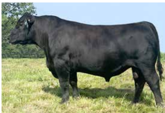
VA GREATER GOOD J528 LOT 5