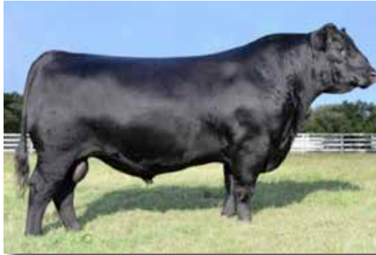
V A R GENERATION 2100 SIRE OF LOT 31