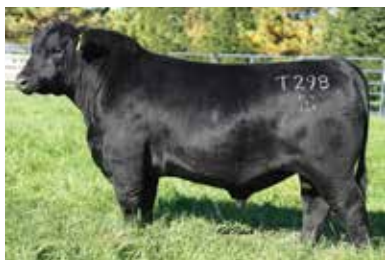
G A R GREATER GOOD SIRE OF LOT 4 & 5