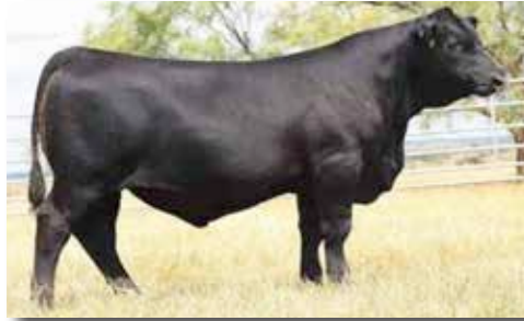
PAR ARES 0615 SERVICE SIRE OF LOT 65

Teague Erica 8002 is a curve bender! She is deep bodied, with loads of dimension, a solid set of feet and smooth movement. She combines TOP 1% WW, YW, RADGE, MARB, $B, and $C. In addition strong SC, HP, and Milk makes this female an excellent blend of high quality EPDs. Combining this female with Ares is an All-Star mating. This combines the Prop Erica and War Calvary lines which are destined to be 2 names that leave a huge impact on the Angus industry. PAR Ares was selected by FB Genetics as the top-selling bull of the fall 2021 sale at Percy Angus Ranch and he has been used extensively in the FB embryo program. Of the Top 50 non-parent females sired by Ares, as of 9/15/23 there has been an average increase of 42 points in $C from Dam to Heifer, WOW! Do a little math on this mating, it is staggering and sure to set you apart from the rest!