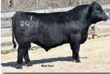
FF RITO 2Q26 OF 356H 9Q13 PGS OF LOT 35