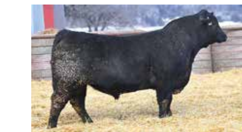
DE-SU VOLUTEER B122 SIRE OF LOT 48 & 49

Consigner: Blue Mound Angus Sheldon Swartzentruber 417-327-5885 Sired by DE-SU Volunteer B122. Top 2% $C, Top 3% $B, Top 2% $W. Volunteer is now deceased and only a limited amount of semen is available. This female had a ratio of 106 at weaning and 102 at yearling.