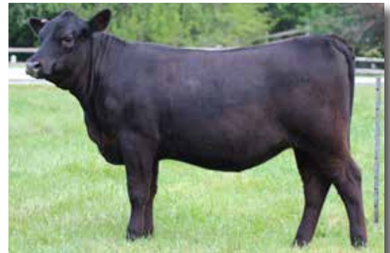
A A FOREVER LADY S102 LOT 51

Consigner: Allegro Angus Craig Stephenson 417-894-4285 This big, broody, docile, yearling Volunteer daughter will give you plenty of growth and performance with a YH of +1.4, 220 $B, and 330 $C. Note: has 10 EPDS in single digit percentiles, with a total of 18 EPDS in the top 25%, and 9 single digit DNA scores. She is STACKED for the future! Plus her dam is a SydGen Pathfinder. Sells open ready to flush!!