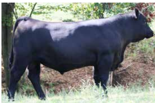
WRR GROWTH FUND 229 LOT 12

Consigner: Wiles Ridge Ranch Truman Wiles 417-252-0726 This is a special Show-Me Select qualified GROWTH FUND son. He is one of only 15 bulls in the breed with his combination of CED, BW, WW, YW, RADG, SCROTAL, CEM, MILK, and $C. He is very unique with his Top 10% calving ease, Top 10% yearling weight, and Top 5% calving ease maternal. We are impressed with his muscle expression and slick hair coat.