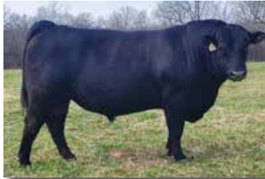
DHT LOA 833 CHARMER 407 SIRE OF LOT 36

Consigner: DHT Angus Cecil Huff 417-250-1300 This female qualifies as Seed Stock certified. Double digit CED and CEM with plus 75 WW, 132 YW and 0.30 RADG. A71 is a great female with 23 EPD's above breed average and 16 EPD's in top 15%. This cow will make a great foundation for any herd. AI to Fireball pasture exposed to Rainfall son. Rain fall was the 3rd most used AI bull in Angus breed with 4698 progeny. Bred AI to 18690054 Fireball on 02/05/23. Pasture exposed to 20421399 from 02/05/2023 to 06/06/2023