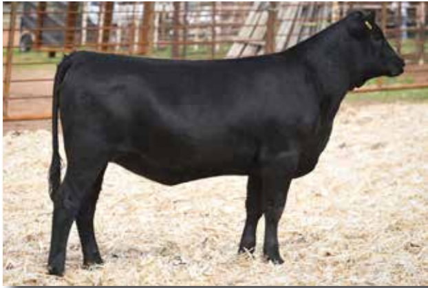
SEO 8509 ROCK STAR 2741 DONOR DAM OF LOT 60