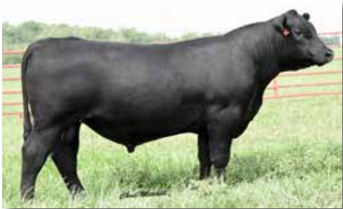
E W A ELEVATE 1166 SERVICE SIRE LOT 68

Selling 3 IVF Embryos and Guaranteeing 1 Pregnancies if transferred by an AETA certified embryologist or Whitaker Embryo services. Buyer will be furnished with certificate of embryo transfer.