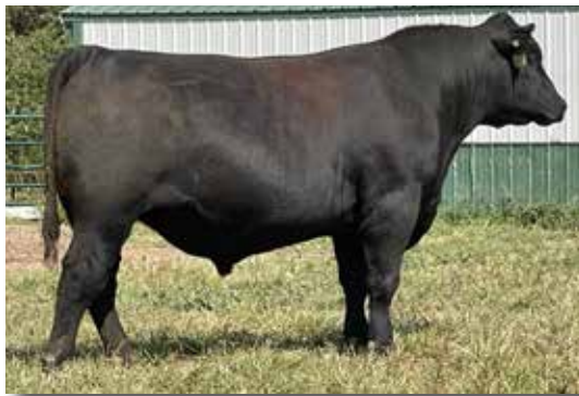
VA GREATER GOOD J521 LOT 4

Performance and carcass specialist. J521 is a Greater Good son with top 10% Marbling and top 15% Ribeye EPDs. The calves sired by this superstar will have top grading carcasses and have the muscle needed to turn a profit. Top 2% RADG, the calves sired will be very efficient gainers. Feeders and packers pay premiums for these type of calves. Top 1% WW & YW. Top 5% $B & $W Top 4% $G and Top 10% $C. Use a bull like Va Greater Good J521 and cash in on record markets, with big calves that will gain and grade well.