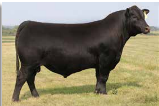
ANKONIAN PARAGON 0C4 MGS OF LOT 21