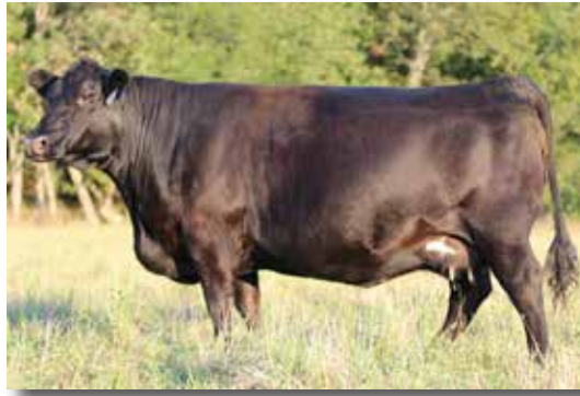
WRR TRIUMPHANT LADY 742 LOT 30

Consigner: Wiles Ridge Ranch Truman Wiles 417-252-0726 Definitely a front pasture cow. She is one of the deepest ribbed, big capacity cows you will find. She is a very productive cow. She had her first calf at 23 months. She has had 4 calves at a 368-day calving interval with an avg; BW ratio of 98, WW ratio of 101, and YW ratio of 105. She is a maternal sister to the second high selling bull at the 2023 Spring SouthWest Tested Bull Sale. Bred 12/08/2022 to Ellingson Deep River Reg # 19853339