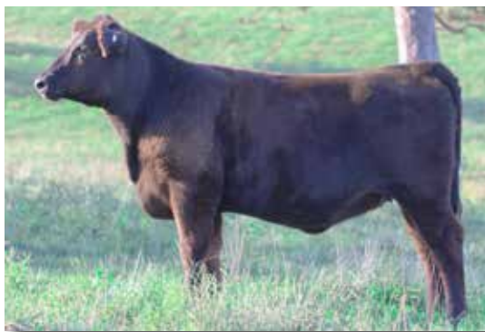
WRR LADY PRIDE 234 LOT 47