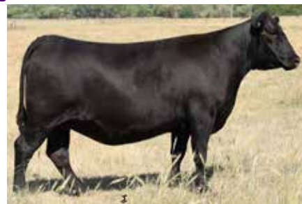
VINTAGE RITA 0399 DONOR DAM OF LOT 70