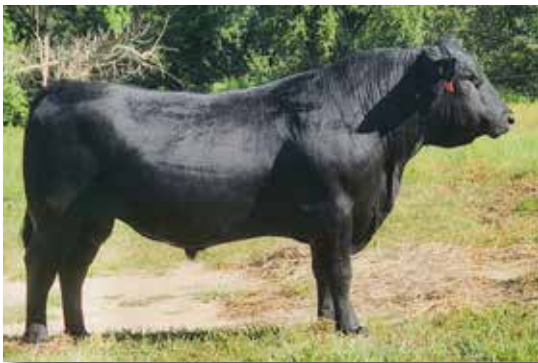
DHT EMBLY ACCLAIM 116 B 1 LOT 17

Consigner: DHT Angus Cecil Huff 417-250-1300 A late entry, but definitely a good to end the bull class on! Top of Angus breed for Weaning and Yearling weight. $Weaned and Carcass Weight . Top for $ Feedlot. Top 15% for $Beef and $Combined. This Acclaim son has 12 EPD's in top 15% or higher adding +76 and + 137 for weaning weight and yearling weight. One of the top bulls for balance of Epd's with 21 above breed average.