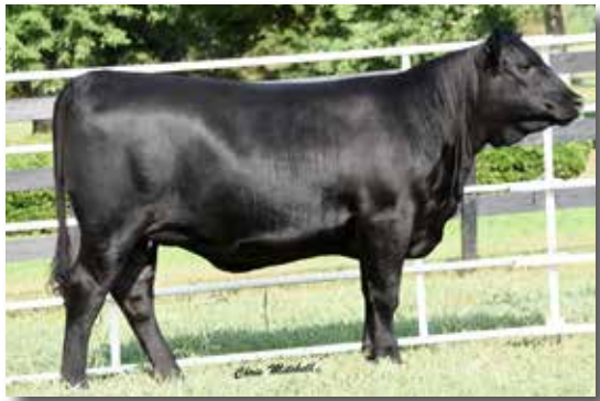
OAKDALE RITA 672 1004 DONOR DAM LOT 64

ELEVATE is an exciting new sire from Edgewood Angus, he ranks at the top of the breed for WW, YW, HP, CEM, MILK, MARB and REA, all with a +8 Show-Me-Select Calving Ease. Few sires offer the complete genetic package as ELEVATE.