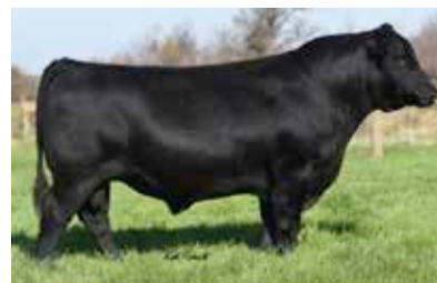
QUAKER HILL MANNING 4XE9 SIRE OF LOT 28