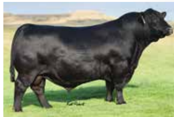
V A R POWER PLAY 7018 SIRE OF LOT 32