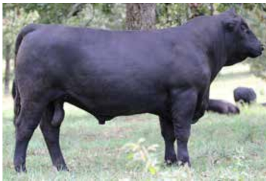
WRR REAL TIME 223 LOT 10

Consigner: Wiles Ridge Ranch Truman Wiles 417-252-0726 Show-Me Select qualified Real Time son, out of a Riverbend None Better Dam. He has a Top 10% weaning weight, Top 15% yearling weight, and Top 20% scrotal. This is a very relaxed, easy going bull. He is picture perfect in his look and he moves really well. Be sure to check him out sale day as he hits all the marks; excellent personality, wonderful phenotype, sleep-easy calving ease, outstanding growth, and profitable feed efficiency!