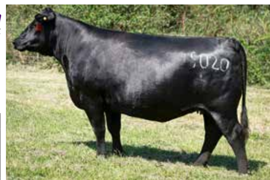
POWELL ERICA 9020 DONOR DAM OF LOT 67

Selling 3 IVF Embryos and Guaranteeing 1 Pregnancies if transferred by an AETA certified embryologist or Whitaker Embryo services. Buyer will be furnished with certificate of embryo transfer.