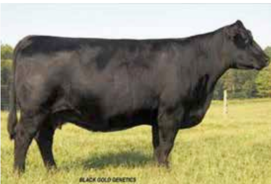
G A R BEXTOR 268 MGD OF LOT 29