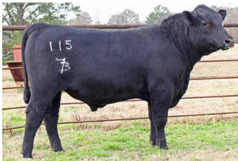
GB FIRESIDE 115 LOT 71 A, B, C SEMEN

GB Fireside 115 is the $84,000 Top Selling Bull from the Spring 2023 Louisiana Angus Association Sale. GB Fireside with his double digit calving ease, excellent growth, huge RE and Marbling figures creates an excellent blend of genetics. All of that and TOP 1% $B & $C.