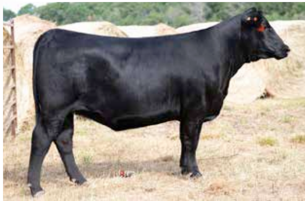
FF RITA 1F39 8S35 FIREBALL DONOR DAM OF LOT 66

Consigner: 3/0 Cattle Co Wes Ogle 417-448-4126 Selling 3 IVF Embryos and Guaranteeing 1 Pregnancies if transferred by an AETA certified embryologist or Whitaker Embryo services. Buyer will be furnished with certificate of embryo transfer.