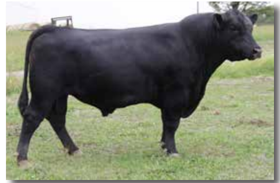
SEAGRAVES HOME TOWN 2189 LOT 1

Consigner: Seagraves Angus Kevin Devore 618-339-0665 A deep bodied, slick haired Home Town son that stems back to the foundational Basin Lucy 178E. An excellent pedigree, combining some of the most prolific animals in the Angus Breed! Sound footed with an excellent stride. Show-Me-Select calving ease, that explodes into TOP 5% WW and TOP 4% YW Growth. Sold carcass epds with every EPD being TOP 15% or better. $B +206, and TOP 2% +341 $C. This bull is primed for raising big growth profit producing calves, be sure to check him out on sale day as he aims to please any cattleman!