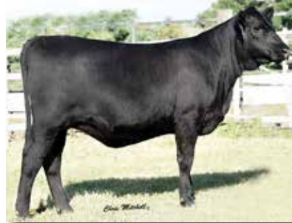
OAKDALE RITA 672 1080 DONOR DAM LOT 63

Selling 3 IVF Embryos and Guaranteeing 1 Pregnancies if transferred by an AETA certified embryologist or Whitaker Embryo services. Buyer will be furnished with certificate of embryo transfer.