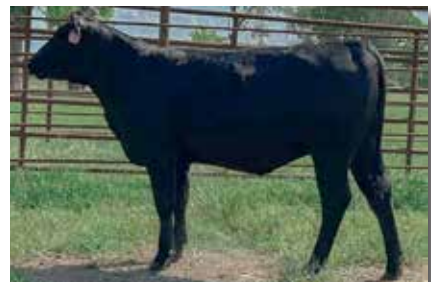
SMPAR FIREBALL 207 LOT 46

Consigner: Show Me Prime Angus Ranch LLC Danise Cummings 417-388-8461 A female that has it all! Sired by GB Fireball 672, and out of a Deer Valley Patriot 3222 Dam this female has a loaded pedigree! She boasts an impressive EPD's you'd expect from this amazing mating! She is TOP 1% for CEM +16, Marb +1.68, $G +113, and HS +0.04. Be sure to circle her amazing $B +207 Top 3% and $C +316 TOP 5%. Sells open ready for buyer to breed to bull of his choice, here is an incredible opportunity get in on Fireball!