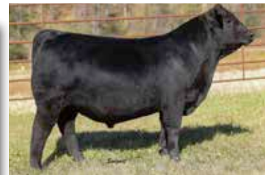
SYMMETRY 228 SERVICE SIRE LOT 62