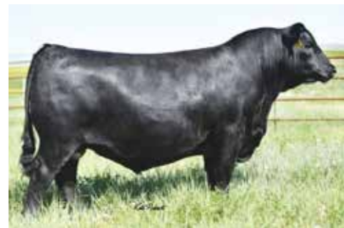
LAR MAN IN BLACK SERVICE SIRE OF LOT 28, 29 & 31