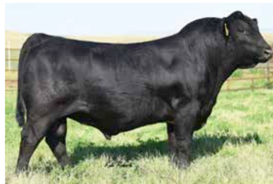
BYERGO BLACK MAGIC 3348 SIRE OF LOT 55

Consigner: BAR Angus Ranch Rob Price 314-974-5263 BAF Rita B201 is a fleshy black 3 y/o cow natural bred to GAR Hometown #20241970. She is an AI daughter of Byergo Black Magic. She has 13 epsds in the top 15% including WW & YW. She is "Targeting the Brand" and will make calves that grow! Pasture exposed 01/01/23 - 09/10/23 to GAR Hometown #20241970 for an April 2024 calf.