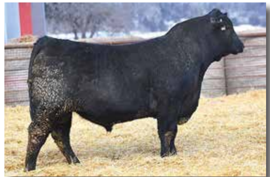
DE-SU VOLUTEER B122 SIRE OF LOT 23A