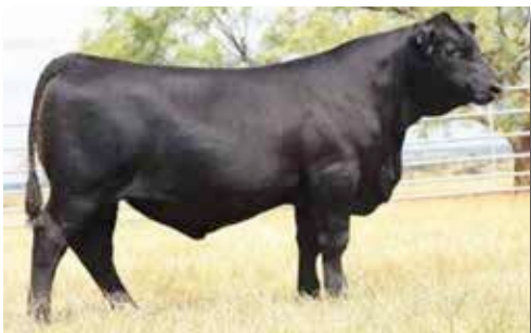
BEAL BREAKTHROUGH SERVICE SIRE OF LOT 69

Selling 3 IVF Embryos and Guaranteeing 1 Pregnancies if transferred by an AETA certified embryologist or Whitaker Embryo services. Buyer will be furnished with certificate of embryo transfer.