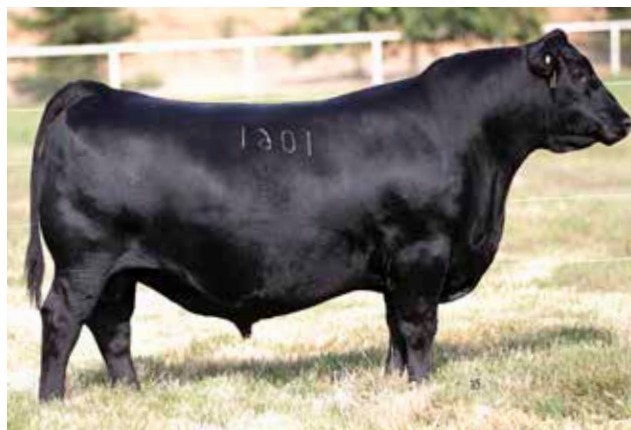
EZAR GETTYSBURG 1061 LOT 76 A, B, C SEMEN