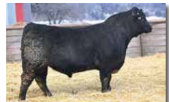
DE-SU VOLUTEER B122 SERVICE SIRE FOR LOT 40

Consigner: Blue Mound Angus Sheldon Swartzentruber 417-327-5885 Sired by SydGen KCF Gavel the $240,000 valuation sire at SydGen. This heifer has a ratio of 104 at weaning and 111 at yearling. Top 5% for $C, $B, and CW. Bred on 4/3/23 to DE-SU Volunteer B122 and will be examined safe to calve 1/10/24.