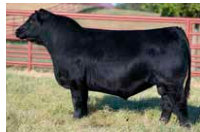
44 VICTORY SERVICE SIRE OF LOT 27