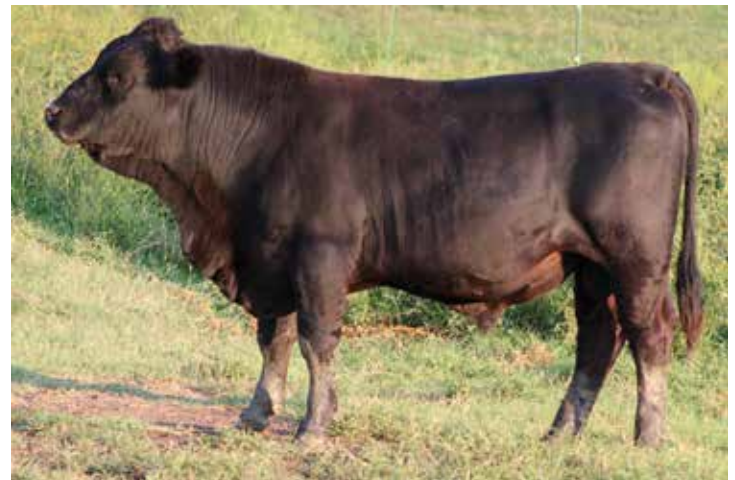
LOT 3 SAM 2204K ET

BW 79; ADJ. WW 501; ADJ YW 1072; PW ADG 3.57; ADJ YR FRAME 6.0