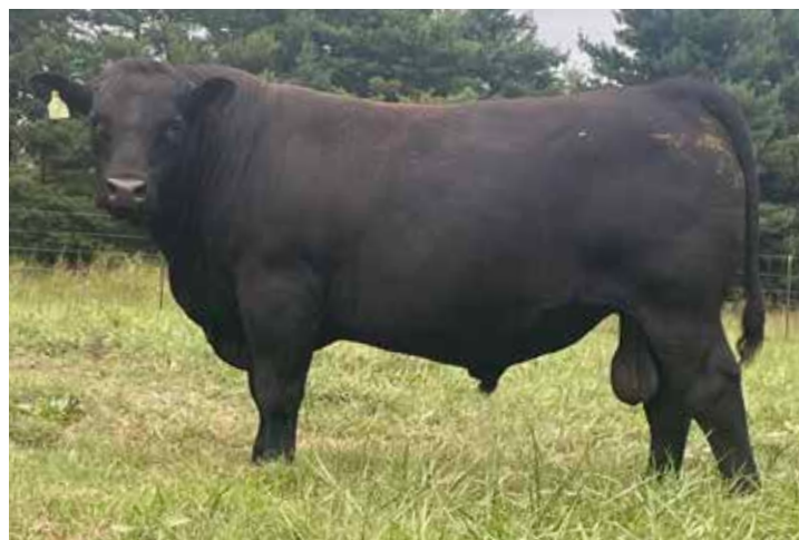
LOT 24 Clear Creek Magnum CC22

BW 68; ADJ. WW 709; ADJ YW 1211; PW ADG 3.14; ADJ YR FRAME 6.1