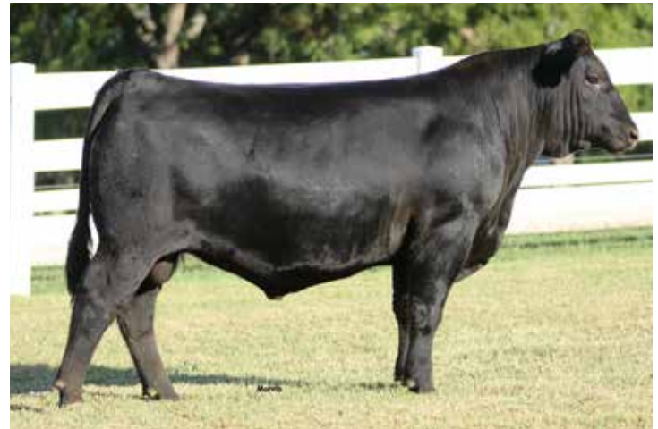
LOT 31 Valley View Regiment 209

BW 71; ADJ. WW 742; ADJ YW 1204; PW ADG 2.89; ADJ YR FRAME 6.5