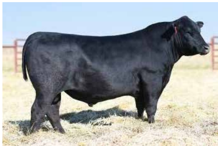
Welytok Prime Divine 6D91 Sire of Lot 12

BW 69; ADJ. WW 748; ADJ YW 1145; PW ADG 2.48; ADJ YR FRAME 6.7