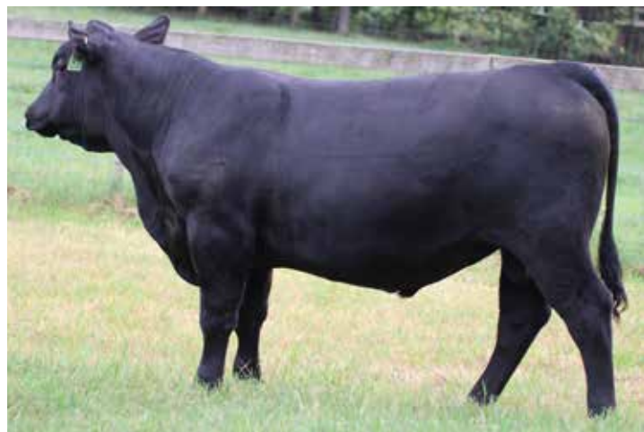
LOT 11 A A Dynamic 82

BW 72; ADJ. WW 755; ADJ YW 1241; PW ADG 3.04; ADJ YR FRAME 6.8