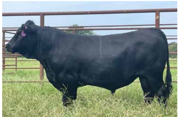
LOT 6 Fireball 206 4616