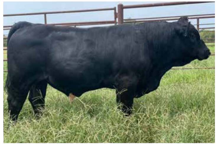
LOT 7 Final Answer 216K 4616