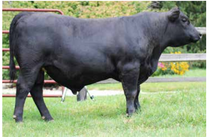
LOT 8 A A Enhance 42