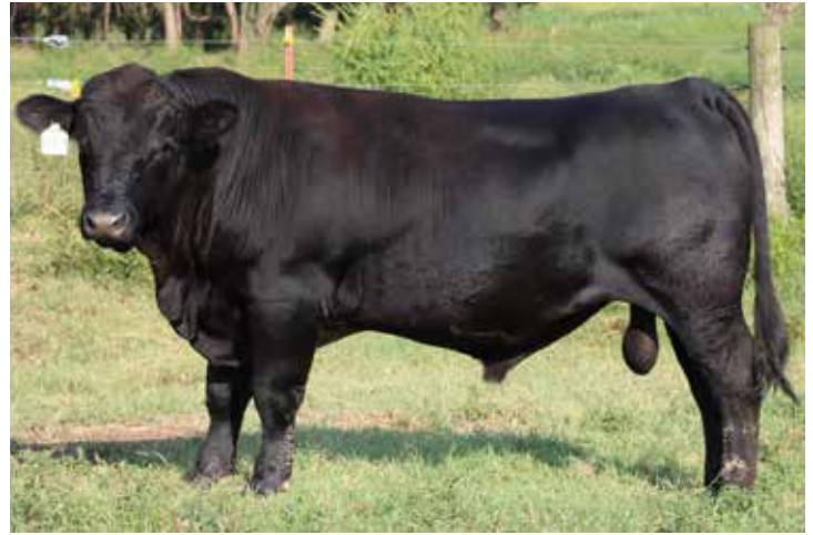
LOT 4 REVELATION 2201K ET

All buyers invited to view the sale animals afternoon sale day.