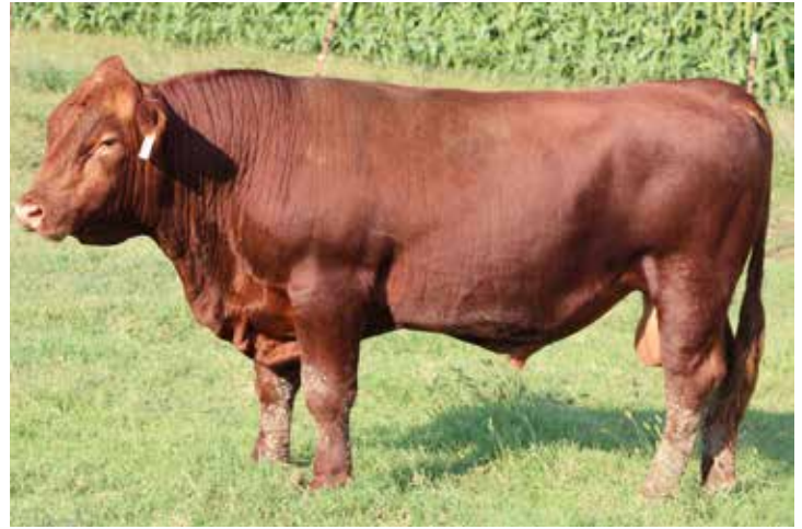
LOT 5 SLEEP EASY