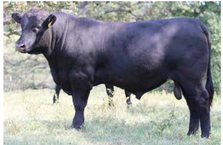
LOT 39 WRR Real Time 217

BW 58; ADJ. WW 675; ADJ YW 1285; PW ADG 3.81; ADJ YR FRAME 7.2