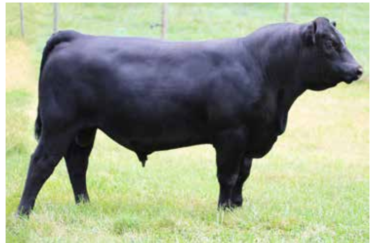
LOT 9 A A Dynamic 62