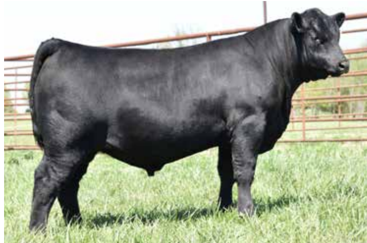
LOT 27 GPN Rainfall 230

BW 83; ADJ. WW 774; ADJ YW 1324; PW ADG 3.44; ADJ YR FRAME 6.8