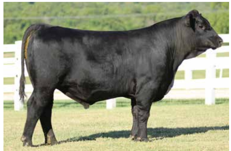
LOT 32 Valley View Growthfund 231

BW 65; ADJ. WW 764; ADJ YW 1196; PW ADG 2.70; ADJ YR FRAME 6.5