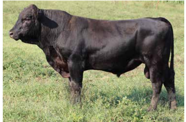
LOT 2 SAM 2203K ET

BW 81; ADJ. WW 638; ADJ YW 1163; PW ADG 3.28; ADJ YR FRAME 6.5