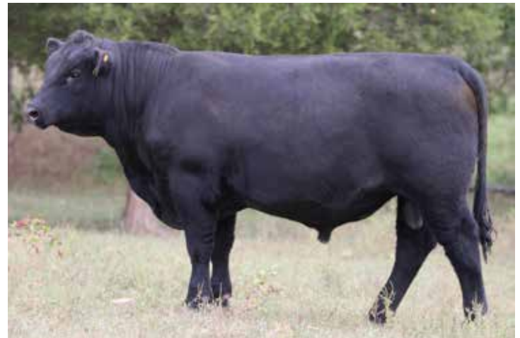
LOT 42 WRR Exponential 246

BW 70; ADJ. WW 785; ADJ YW 1327; PW ADG 3.39; ADJ YR FRAME 7.1