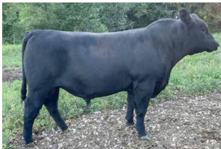
LOT 26 GPN Ten X 2N11