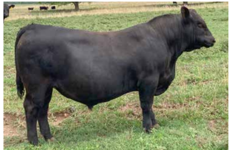
LOT 35 VLF Iconic 45K

Can't make it to the sale? Call ahead to place a bid, or bid online www.LiveWireAuction.com