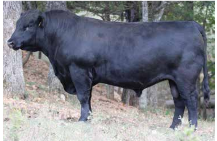
LOT 37 WRR Greater Good 205

BW 57; ADJ. WW 799; ADJ YW 1340; PW ADG 3.38; ADJ YR FRAME 6.6