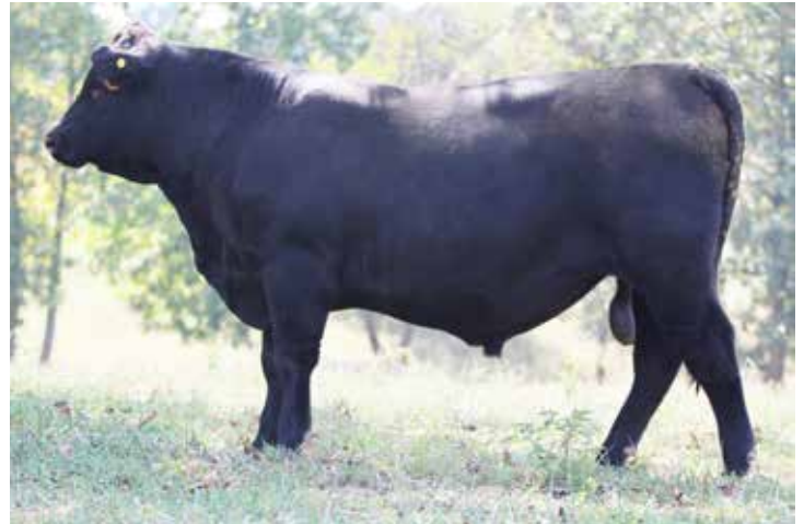
LOT 41 WRR Growth Fund 238

BW 75; ADJ. WW 793; ADJ YW 1345; PW ADG 3.45; ADJ YR FRAME 6.9