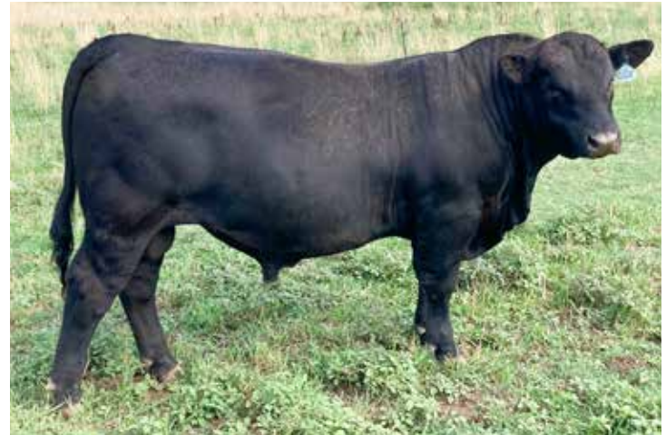
LOT 36 VLF Iconic 50K

BW 78; ADJ. WW 814; ADJ YW 1346; PW ADG 3.33; ADJ YR FRAME 6.5