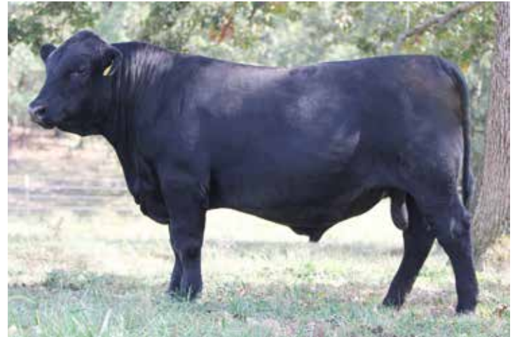
LOT 38 WRR Magic Man 208

BW 50; ADJ. WW 804; ADJ YW 1404; PW ADG 3.75; ADJ YR FRAME 7.5