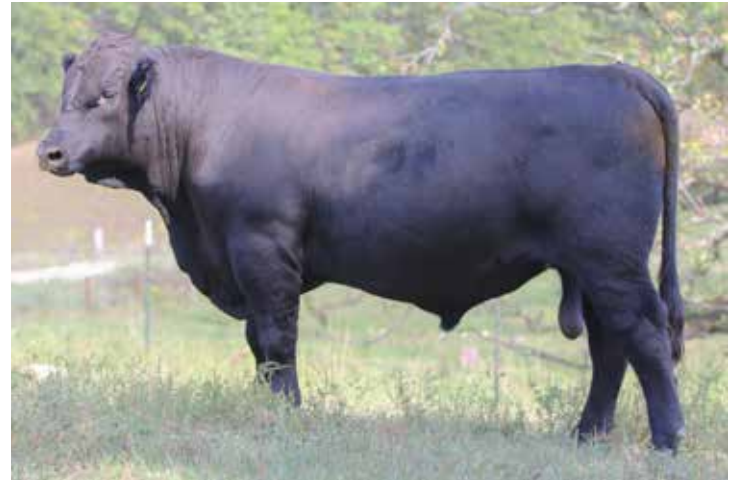
LOT 40 WRR Real Time 224

BW 62; ADJ. WW 805; ADJ YW 1439; PW ADG 3.96; ADJ YR FRAME 7.4