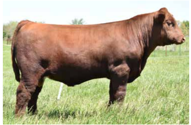
LOT 1 NAYLOR Lexington 27

BW 56; ADJ. WW 660; ADJ YW 1166; PW ADG 3.16; ADJ YR FRAME 6.0