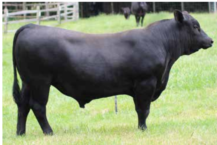
LOT 10 A A Gavel 72

BW 90; ADJ. WW 696; ADJ YW 1200; PW ADG 3.15; ADJ YR FRAME 6.9