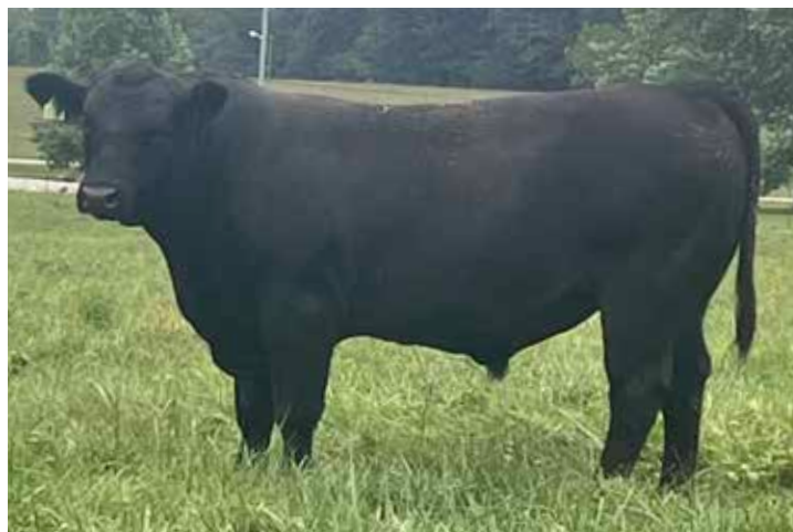
LOT 25 Clear Creek Magnitude CC26

BW 74; ADJ. WW 660; ADJ YW 1135; PW ADG 2.97; ADJ YR FRAME 6.1