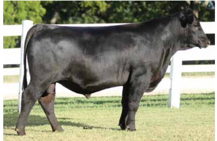
LOT 30 Valley View Investor 8

BW 69; ADJ. WW 810; ADJ YW 1213; PW ADG 2.52; ADJ YR FRAME 7.0