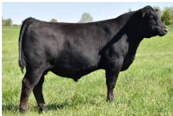
LOT 28 GPN Enhance 236

BW 74; ADJ. WW 771; ADJ YW 1318; PW ADG 3.42; ADJ YR FRAME 6.5