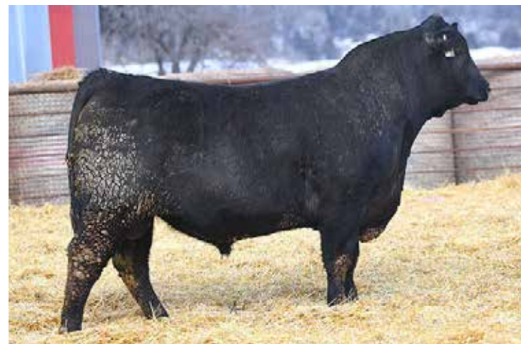
DE-SU Volunteer B122 Sire of Lot 15 & 23

BW 55; ADJ. WW 617; ADJ YW 1169; PW ADG 3.45; ADJ YR FRAME 6.7